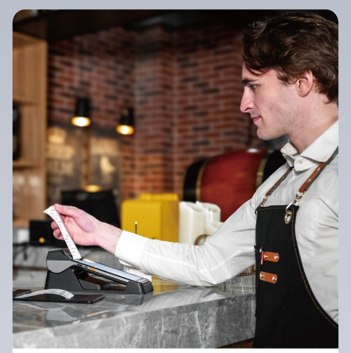
Delivery Order Management