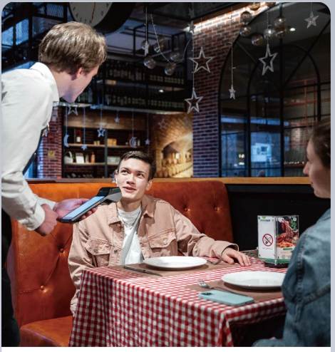
Mobile Ordering Excellence