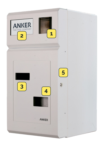
Cash recycler also suitable for use under a self-checkout and for built-in installation

* Status Prototyp, Subject to change without notice