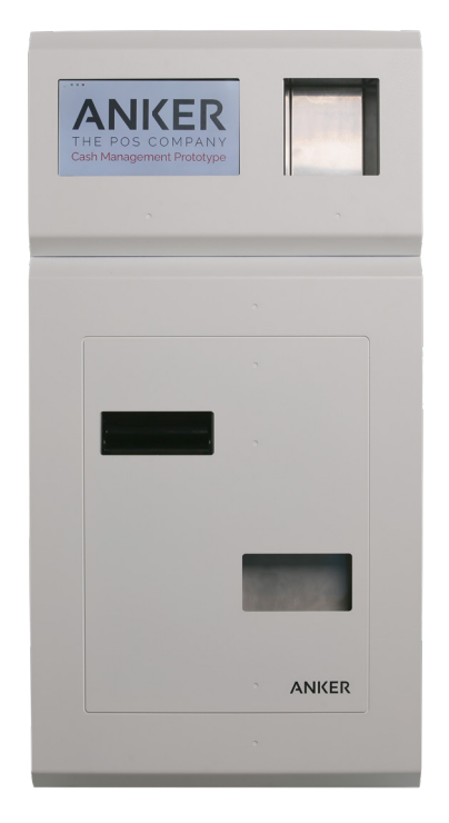
Cash recycler front view